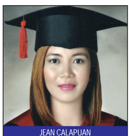
KPGROUP PHILIPPINES, INC. DOCTOR OF PHILOSOPHY ON-GOING UNIVERSITY OF SAN CARLOS (CEBU CITY)