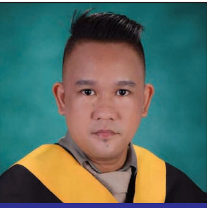
JAYMAR SATSATIN SUPER FLEX LOGISTIC, INC. BACHELOR OF SCIENCE IN BUSINESS ADMINISTRATION 2021 AN PEDRO COLLEGE OF BUSINESS ADMINISTRATION (SAN PEDRO, LAGUNA